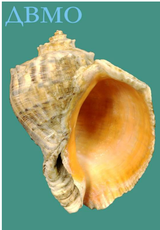
Rapana venosa (Valenciennes, 1848) (Muricidae), or the veined rapa whelk , a rare large local gastropod was selected for logo of the 2019 RFEMS seminar